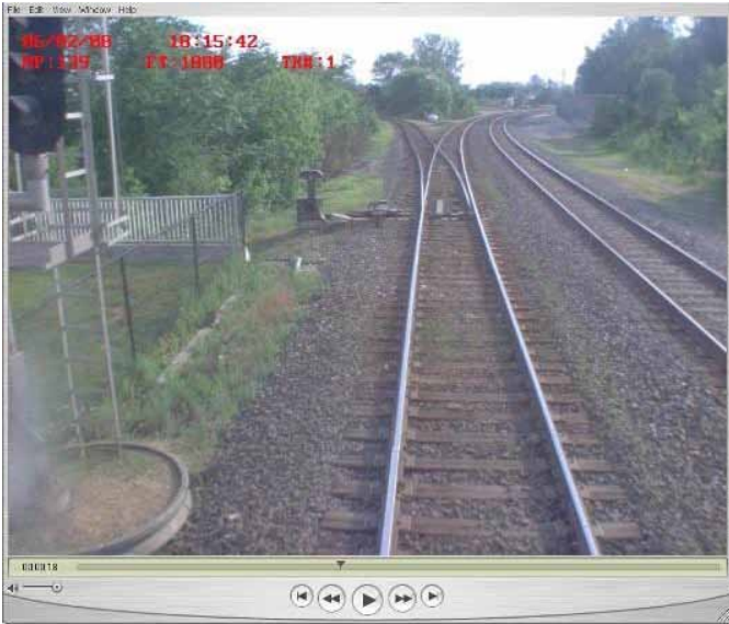
Images of the Railroad

The system utilizes Basler GigE ace cameras to provide images of the railroad right of way for visual office processing of poor conditions such as excessive vegetation or poor drainage conditions