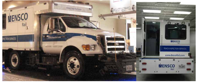
ENSCO's Comprehensive Track Inspection Vehicle

ENSCO has selected the Basler product lines for important technology applications for several key reasons: