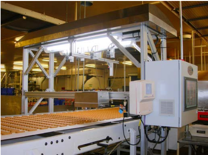
Biscuit Inspection System