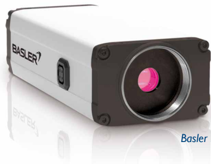
Basler IP Camera

Second Nature Farm belongs to many organizations and affiliations including USDF, USEF, DVCTA and AJPHA. All of these organizations are as serious about safety as Delduco is. SNF’s staff of experienced riders also gives an average of 35 lessons per week and aids in buying and selling dozens of horses annually. All things taken into account, it is clear why Second Nature Farm chose Basler IP Cameras to help maintain a safe and secure operation.