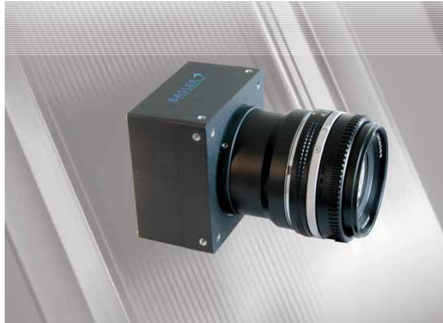
The L400 and L800 Line Scan Series