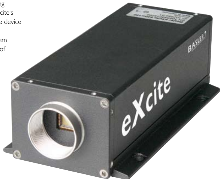
Contact Plane (cp) Housing Variant

A power supply and all of the cables required for easy system integration are available from Basler. Please refer to the list of accessories.