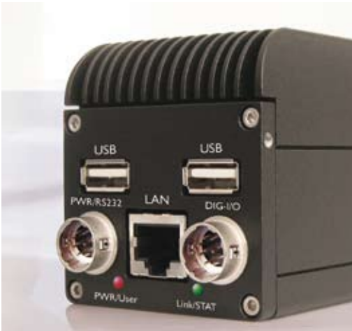
Heat Sink Housing Variant – Back Side

Given the versatile interfaces on the eXcite, communication with the external environment can be accomplished in many different ways. The Gigabit Ethernet interface provides ample bandwidth to allow continuous and uninterrupted transfer of high data volumes between devices on a LAN. The devices can be standard PCs or other eXcite cameras. The eXcite's USB 2.0 interface supports on-the-fly connection of additional hardware. In addition to supplying a connection point for a keyboard and mouse, the USB 2.0 interface supports the exchange of data in the field via a flash drive or a disk drive. A connection to a PLC can be established via the serial RS-232 interface or via the freely configurable digital I/O ports. All digital I/O ports are opto-isolated to help ensure safe processing.