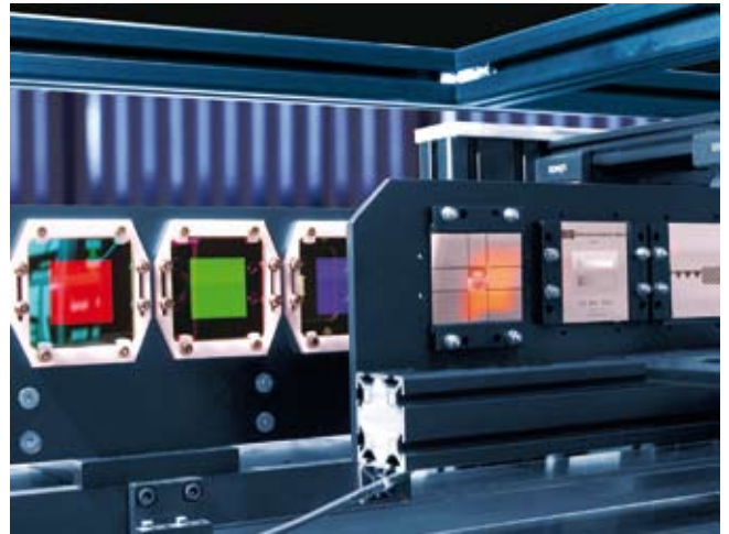
The Basler eXcite is measured by the CTT+ according to the EMVA 1288 standard